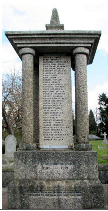
The dates on the St. Stephensby-Saltash World War 1 Memorial are 1914 – 1919.

Why is there a difference between the dates of the end of World War 1 on these two War Memorials?