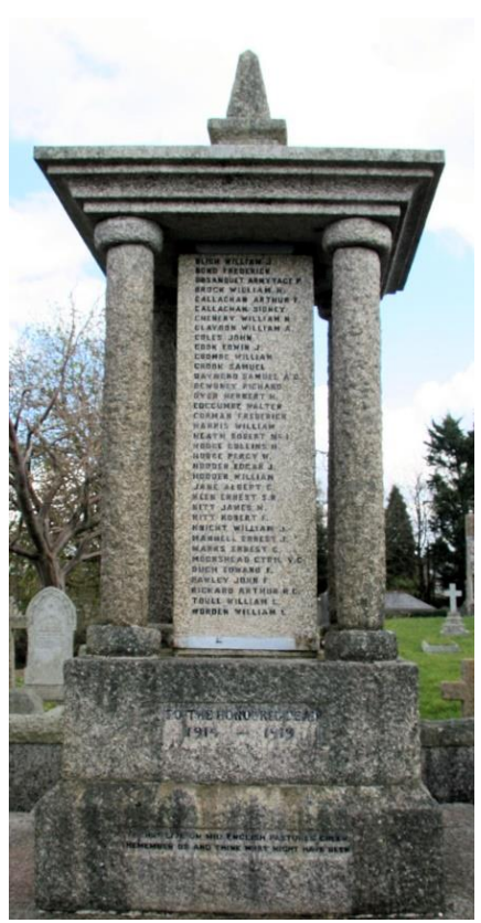
Above .St Stephens by Saltash